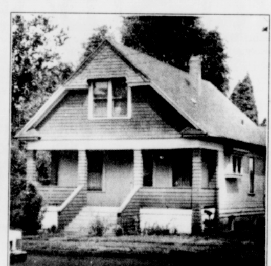
Before and after photos of a successful home repair loan project — one more family showing neighborhood pride.

Great Program! A golden opportunity for those of us who qualify. I could not have afforded the work without your help. Thanks! —A N.E. Homeowner