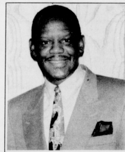
Minister Gregory Fobbs

Radio Ministry Each Sunday, 11:00 AM - KBMS 288-1092