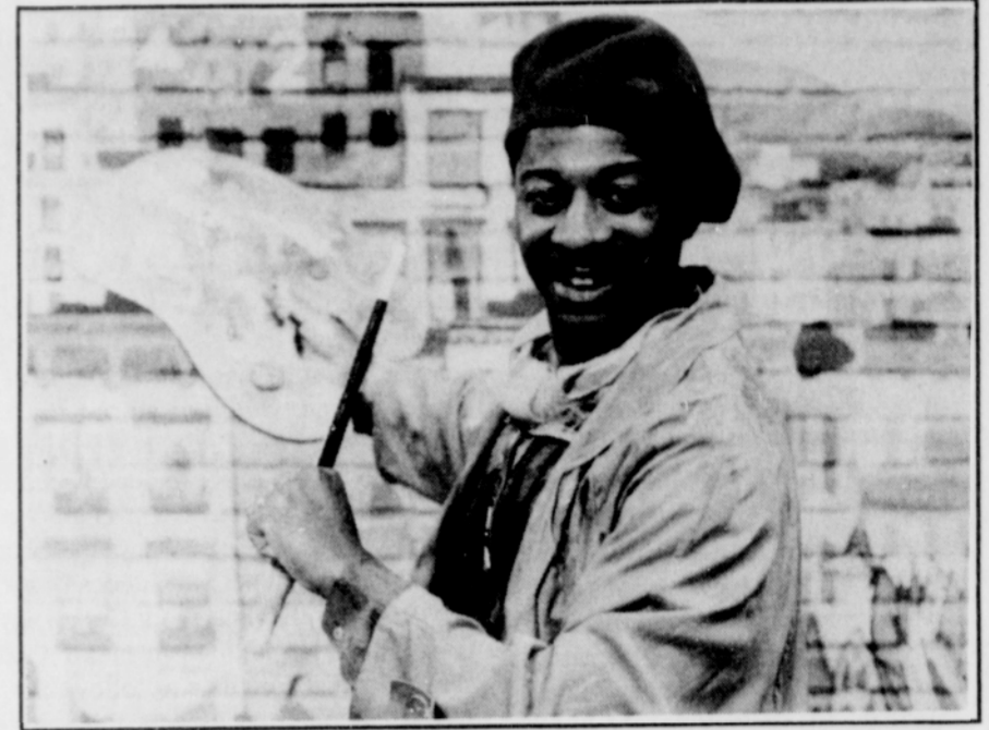
Robert Townsend portrays "Speedy Van Go," the fastest painter in the world, as he paints a mural on Sesame Street airing January 15, 1992 on PBS.