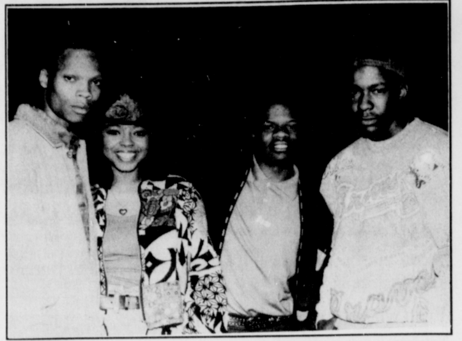
Motown's smiling sensation Shanice Wilson is joined by Ronnie DeVoe, Ricky Bell and Bobby Brown on the set of Another Bad Creation's recent "Spydermann" video shoot. Shanice has good reason to smile; her just-released "I Love Your Smile" single and Inner Child album, both produced by Grammy-winning hitmaker Narada Michael Walden (Whitney Houston, Mariah Carey, Aretha Franklin, etc.), have won the ears and hearts of radio and fans alike. Pictured (l-r) Ronnie, Shanice, Ricky and Bobby.