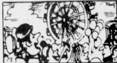
The first ferris wheel was erected at the 1893 Columbian Exposition in Chicago.

committees have been formed to raise funds and generate support for the school. The primary goal of the theatre is to provide a top-notch theatre school for children and adults. The school offers quarterly eight to nine week classes for ages six to adult including performance showcases, acting skills, improvisation, audition workshops and movement for the theatre. The school also offers four to five children's theatre productions a year using children and adults from the theatre school. This year's productions include Annabelle Broom, One Thousand Cranes, How to Eat Like A Child and Snow White And The Seven Dwarfs. For the Christmas season Portland Civic Theatre Academy is producing the modern holiday classic, The Best Christmas Pageant Ever on the mainstage December 13 through December 24. This is a delightful Christmas tale about the Herdman children, possibly the worst kids ever, who lie, cheat and steal their way into the Christmas pageant. Both they and the audience are transformed by the power of theatre and the magic of Christmas. For details about the school or board, call Portland Civic Theatre Academy at 248-9158. For information about Best Christmas Pageant Ever, call the box office at 226-4026.