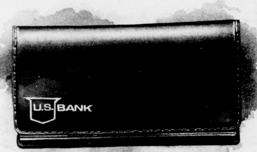
For 6 months, don't pay for our U-Check Account.