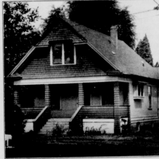
Before and after photos of a successful PDC housing loan project

"Great Program! A golden opportunity for those of us who qualify. I could not have afforded the work without your help. Thanks!" —A N.E. Home Owner