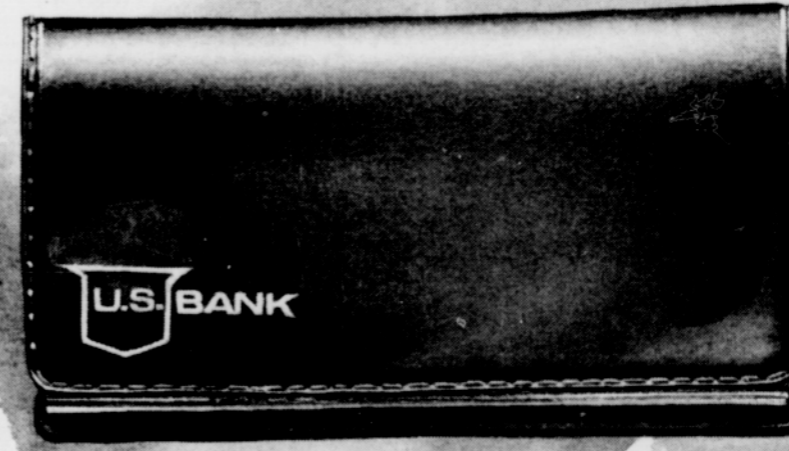
Or enjoy not paying for our Student Checking Account.

Right now, although not forever, you can walk into any U.S. Bank branch in Oregon, open almost any checking account we sell, and then spend the next six months not paying a nickel for it.