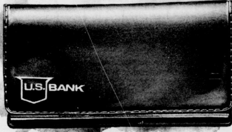
Or, if you prefer, don't pay for the Only Account.™