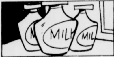
Echo Farms Dairy Co. of New York introduced the milk bottle in 1879.

One Church, One Child of Oregon was founded in 1988. One Church, One Child's mission is to seek African American families to adopt African American children.