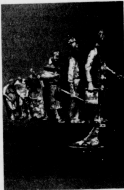
"EVOLUTION OF A PEOPLE," by sculptor Ed Dwight.