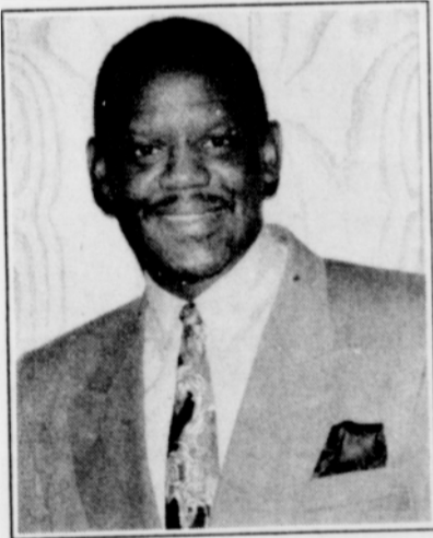
Minister Gregory Fobbs