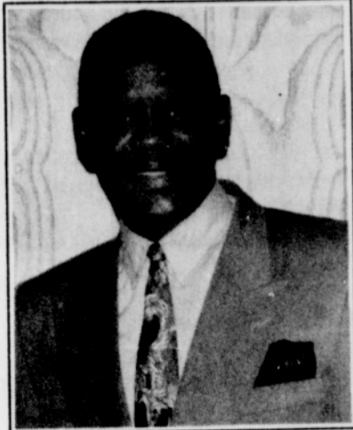
Minister Gregory Fobbs