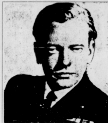
top left, Abraham Hannibal, "Negro of Peter the Great." top right, Admiral Ivan Hannibal, his son. bottom left, Pushkin, great-grandson of Hannibal. bottom right Marquess of Milford Haven, descendant of Pushkin, great-grandson of Queen Victoria, cousin of George VI and best man at the Wedding of Princess Elizabeth, heiress to Britain's throne.

Satellite television shows Moscow crowds honoring their first revolutionary hero, THE BLACK POET ALEXANDER PUSHKIN as the coup fails. With his noble and soulful masterpiece, "Ode to Liberty," he became spokesman for the poor and oppressed of his time (1799-1837). His powerful pen moved the masses to overthrow the tyranny of the Czars.