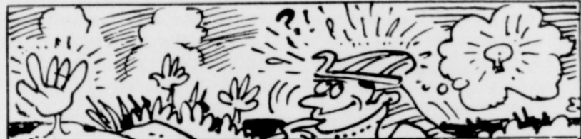
The leaves of the fan palm tree spread out like the fingers of a hand. It is thought that this suggested the idea to its early namers.