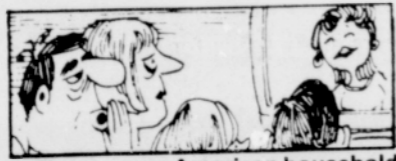
The average American household watches TV for seven hours and two minutes a day according to A.C. Nielson reports.

For more information or tickets, please call 281-7043 or 281-3088.