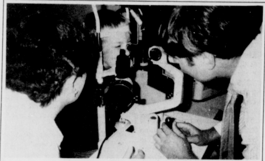
A four year resident does a free screening for a child at Cascade Vision Center.