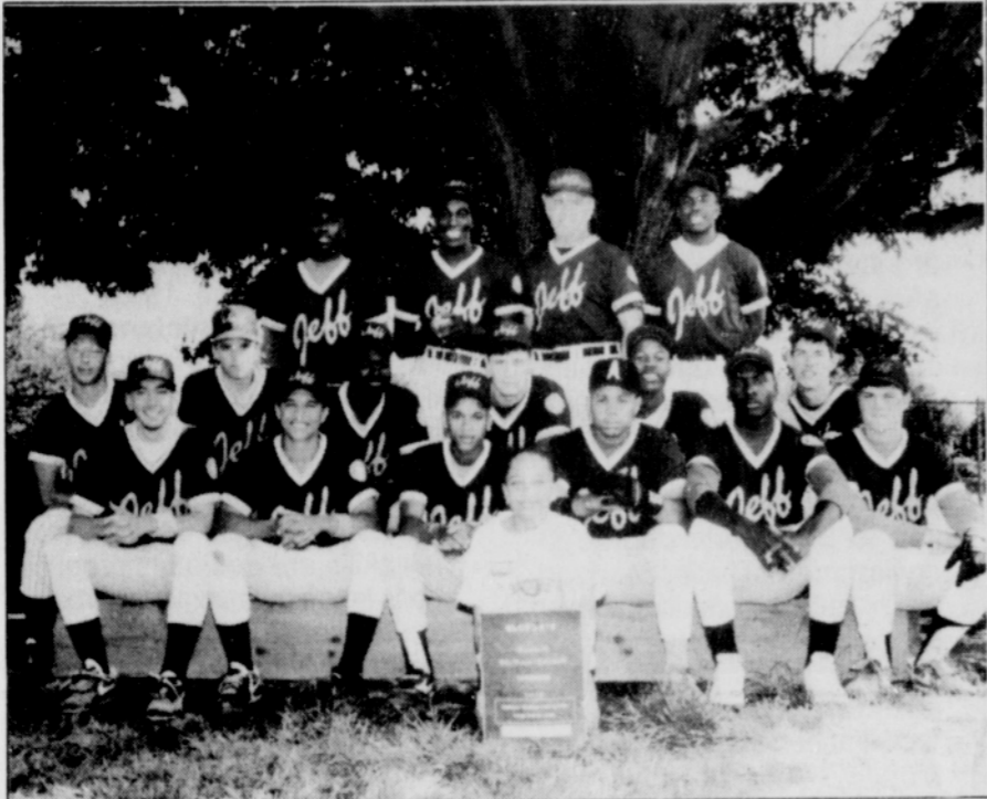
Jeff Team Picture