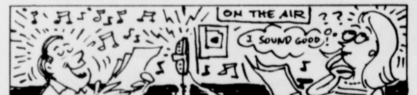
In the 1945 movie To Have and Have Not Lauren Bacall's singing voice was dubbed in by 14-year-old Andy Williams.

Congratulations, Boys II Men. You're going to be something in years to come. Peace.