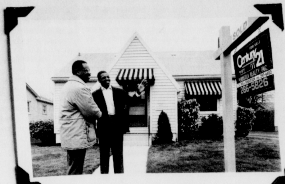
The Community Lending Center helps every step of the way.

Community Lending Center 5730 NE Martin Luther King Jr. Blvd. Portland, Oregon 97211 • 225-3751