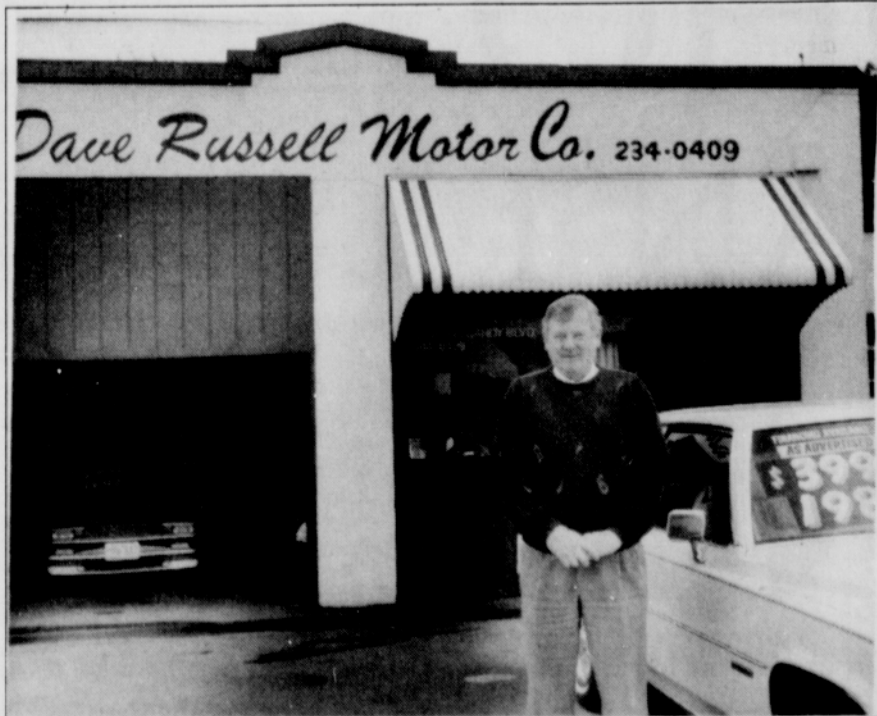
Dave Russell Motor Co. 234-0409

We're getting into the graduation mode. If you have someone who has "made it" let them know how proud we are of them. Education is a precious tool. Let our young men and women know that we support them in their efforts. At least say Congratulations!