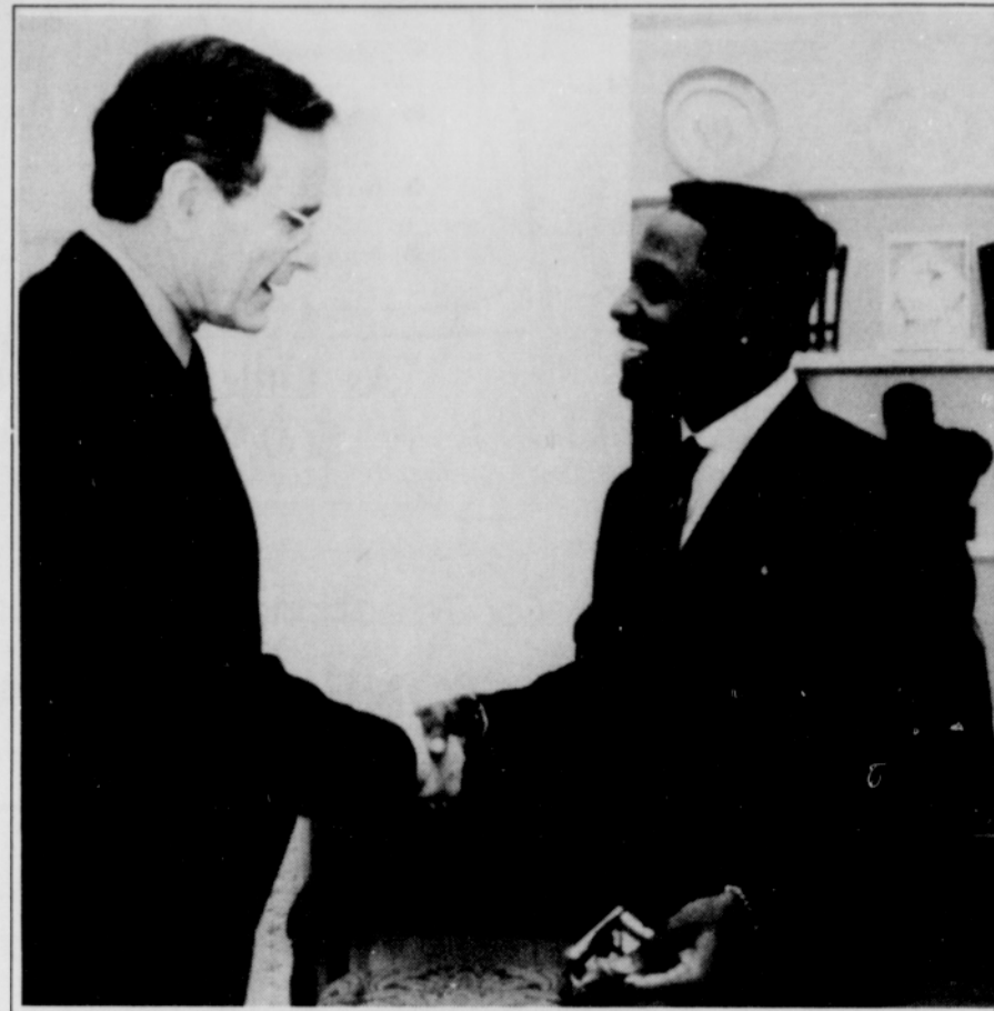
President George Bush shakes hands with Johnny Gill

President George Bush recently met with Motown's Johnny Gill and designated him a Contributing Leader of The Points of Light program. On behalf of the White House Office of National Service, Gill is helping the President acknowledge and thank "Daily Points of Light" in various cities along his tour.