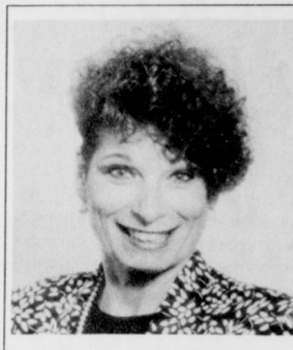
Vera Katz, (D) State Rep.

State Representative Vera Katz (D-Portland) will unveil the full details of a comprehensive reform of Oregon's education system at a press conference set for 8:45 am, Thursday, April 5th.