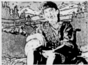
EASTER SEALS '91 The power to overcome.

Coleman said more than 60,000 new and renewing service permittees have successfully completed the education course since the law was enacted. Server education courses are offered by 18 private providers in the state.