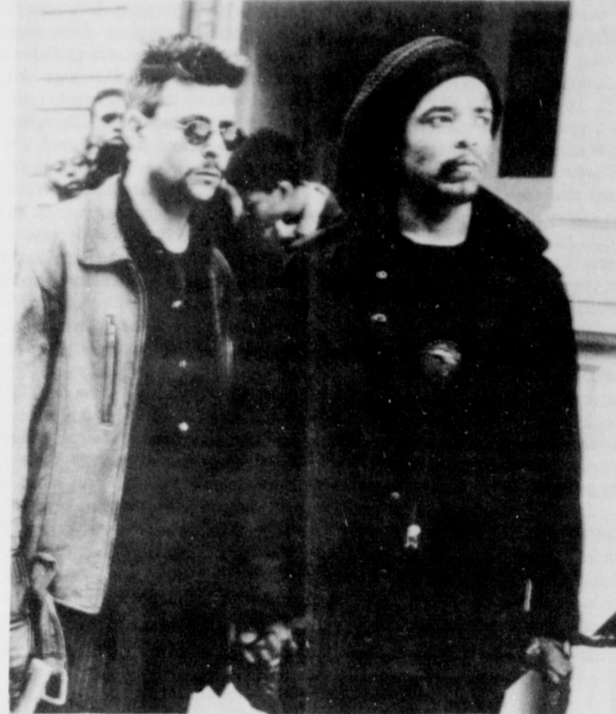
Judd Nelson and rapper Ice-T play streetwise cops on the trail of an inner-city crack dealer in New Jack City, a Warner Bros. Pictures release directed by Mario Van Peebles. The New Jack City soundtrack album is available on Giant/Reprise Records and features performances by Ice-T, 2 Live Crew, Queen Latifah, Keith Sweat, Johnny Gill, Christopher Williams, Guy and newcomers Color Me Badd, Essence and F.S. Effect

"New Jack." A term that's come to describe a new sound of music, a new street hustler, a new executive, vital and exciting, emerging from America's inner cities. Now both the sights and the sounds of that urban landscape have come to life in New Jack City , an extraordinary new film with a powerful original soundtrack album on giant Records.