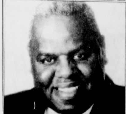
HAROLD WILLIAMS COMMUNITY COLLEGE - zone #2