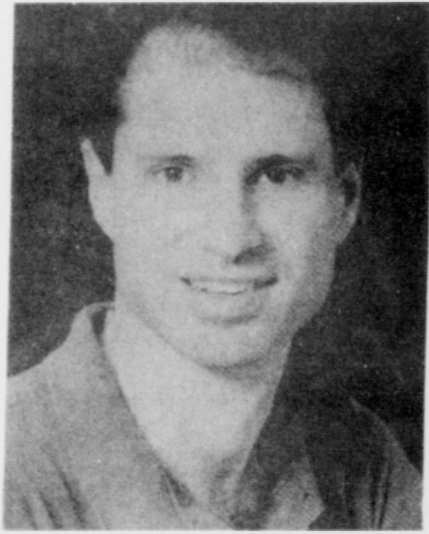
CONGRESSMAN RON WYDEN

Dr. Martin Luther King, Jr.--Acceptance speech, Nobel Peace Prize, Dec. 10, 1964