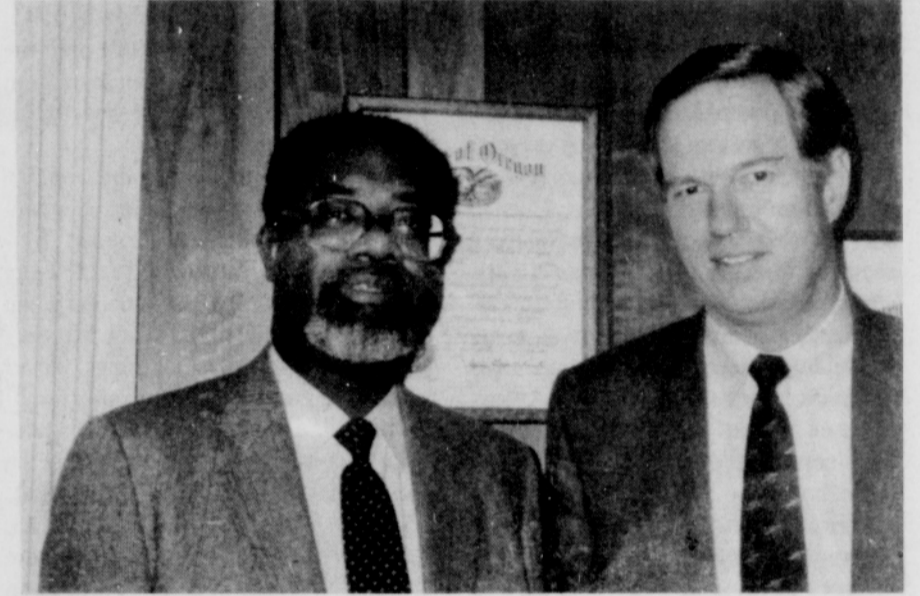
Judge Roosevelt Robinson