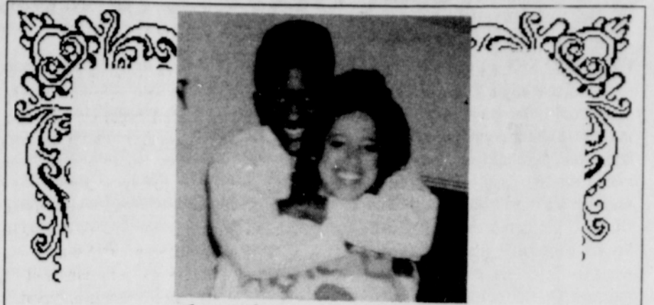
The time has come for the unification of two friends who have learned to laugh, love and honour one another.

All donated food will remain in the community in which it is collected.