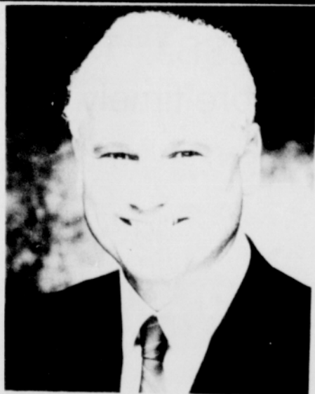
Governor Neil Goldschmidt