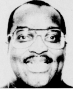
COME JOIN US