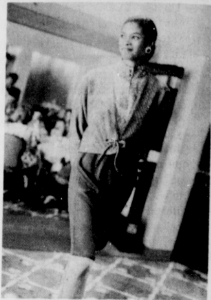
A MODEL DISPLAYS UPCOMING NORDSTROM'S FASHIONS

Plans are underway for the Nordstrom evening gala to celebrate the opening of their brand new Lloyd Center store. The event will be held on Wednesday, August 22. All proceeds will benefit the Parry Center for Children.