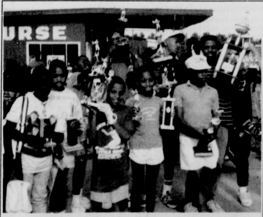
YOUTH LEISURE HOUR GOLF CLUB