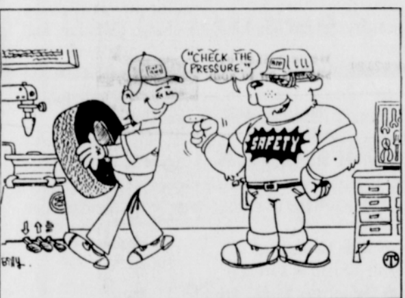
Do not put a 16-inch tire on a 16.5-inch rim and inflate beyond rated tire pressure. The tire can explode, causing injury.