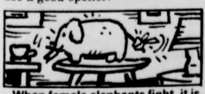
When female elephants fight, it is said, they usually try to bite off each other's tail.

Let's face it, unless you're Tom Cruise or Paul Newman, you could use a good opener.