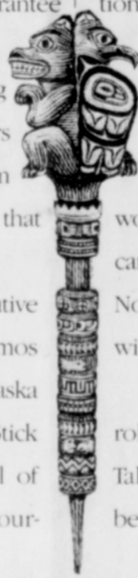
The Talking Stick It doesn't actually talk. After all, it's a stick.

And, second, rolled up inside the Talking Stick will be a proclamation of peace, signed by Presidents Gorbachev and Bush, which will be on display at stopover points along the way.