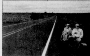
Hurry! Seats are going fast! Okay, so maybe not all that fast.

But don't delay. Those 4,848 acres could go just like THAT. Well, okay, maybe not.