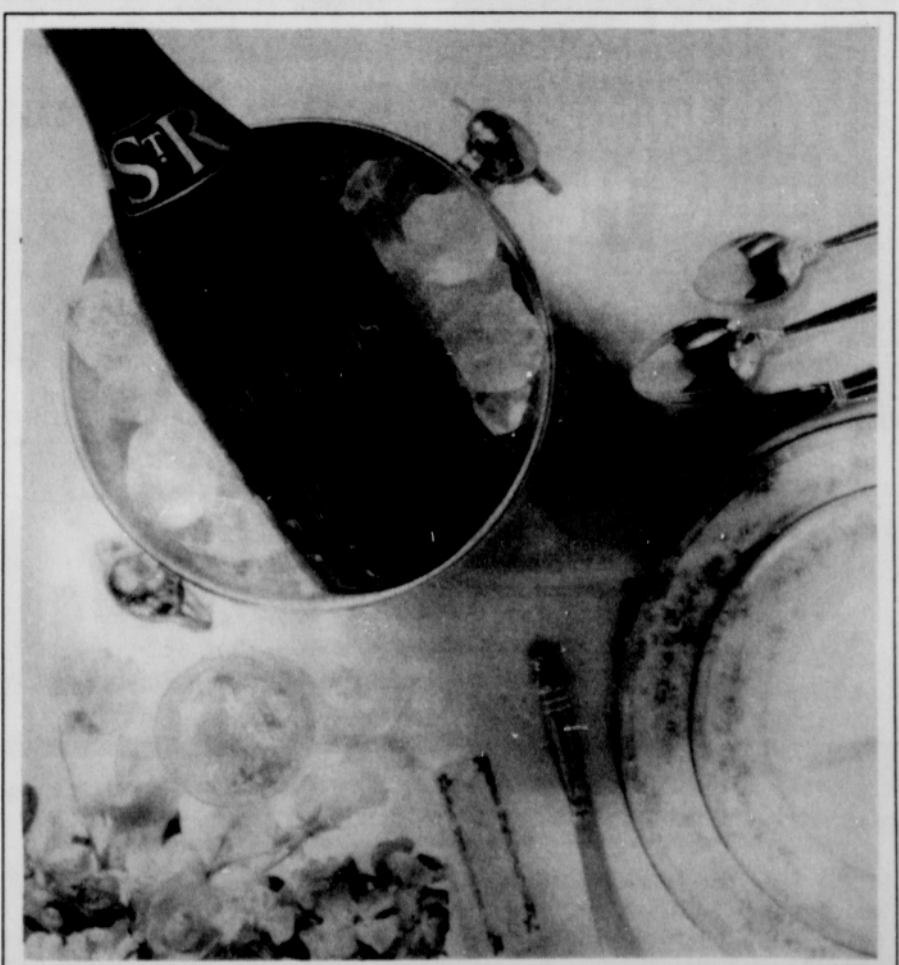
For the enjoyment of your non-drinking wedding guests, who don't consume alcoholic beverages for health, diet or safety reasons, serve St. Regis Champagne. It offers all the flavor, character and aftertaste of regular champagne but none of the alcohol and only half the calories.