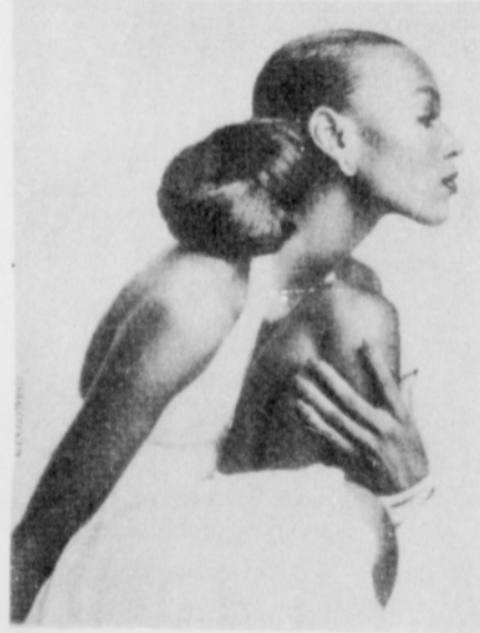
When Blacks were breaking into the fashion industry in the 1960s, Naomi Sims (b. 1939) was one of the first successful black models to appear in major fashion magazines throughout the world. Sims retired from modeling in 1973 to write her best-selling book on health and beauty for black women and to establish a wig manufacturing company. She started another company in 1980 to produce a line of fragrance products known as "Naomi."