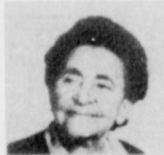
Well known in Jacksonville, Florida, as the "angel of mercy," Eartha M.M. White (1876-1974) helped finance her extensive social service work with profits from a series of small businesses and real estate investments. White was a charter member of the National Negro Business League and served as its historian. With A. Philip Randolph she helped organize the 1941 march on Washington, a protest against job discrimination. In 1928 she founded the Clara White Mission which became the headquarters of several agencies and provided relief services to thousands of black people during the Depression.