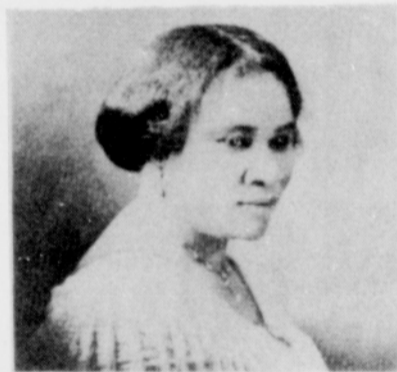
Before becoming the first female Black American millionaire, Madame C.J. Walker (1867-1919) worked for 18 years as a washerwoman. In 1905 she invented the "Walker Method" for treating hair and a line of cosmetics which became so popular that the Madame C.J. Walker Manufacturing Company was established, eventually employing 3,000 workers. Walker supported the NAACP and homes for the aged, she provided scholarships at Tuskegee-Palmer Memorial Institute, and founded an academy for girls in West Africa.