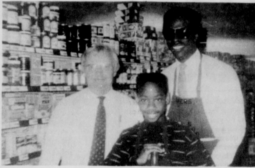
On The Move

For over 88 years, Stroheckers has served Portland's west hills with its rapidly expanding, well-stocked grocery mart. Since 1902, the family-owned operation has provided quality service and quality products to enhance its "Customer first", business approach. Offering a full service grocery line, delicatessen, a complete wine cellar and floral services, among more than 44,000 items in its inventory, Stroheckers is proud most of being one of the few grocers in town who still delivers to customers. While delivery is restricted primarily to senior and the handicapped, it is a service they have extended for years, and contributes largely to their booming business and overwhelming customer satisfaction. The business is also pleased with the introduction of a new product in its grocer line--Baker's Cajun Style Bar-B-Q Sauce. Stroheckers, a full union shop, employs 63 full and part time employees and is considering even further expansion.