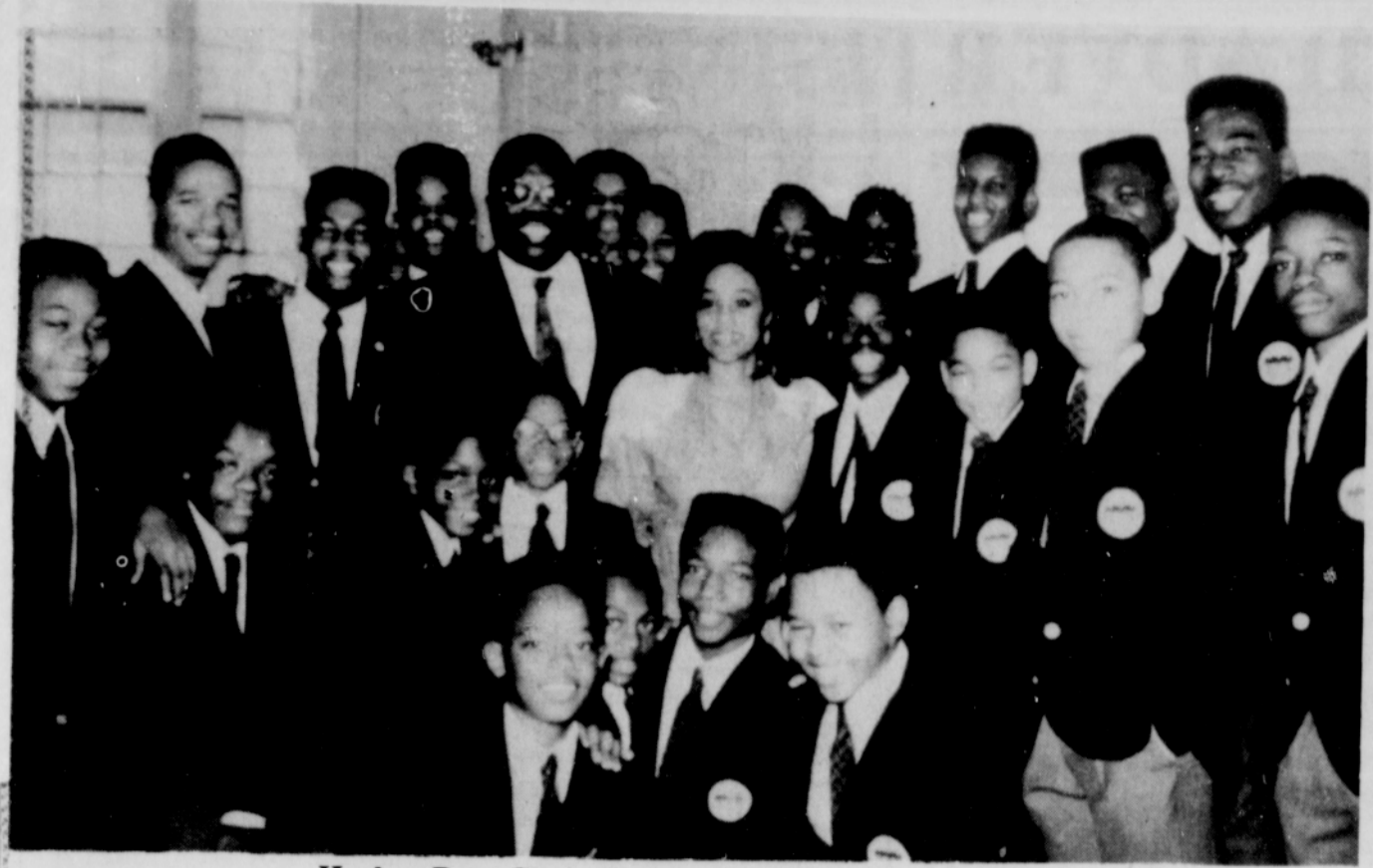
Harlem Boys Choir Featured on Ebony/JET Showcase

Members of the Boys Choir of Harlem take time out from rehearsals to talk about the preparation, skill and discipline required to be one of the most acclaimed music ensembles in the world.