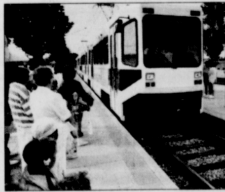
Portland's MAX light rail system, widely acknowledged as one of the nation's most successful, played a key part in Tri-Met being named America's best transit system this year.

To be sure, MAX has helped alleviate congestion on the Banfield and parallel eastside streets. And close to half of downtown's rush hour commuters use the bus or MAX. But look around. The Sunset Highway is crowded beyond capacity, and downtown Beaverton is strangled with traffic. Traffic's getting worse, and with the number of jobs here projected to increase by 46% in just 20 years, we haven't seen anything yet.