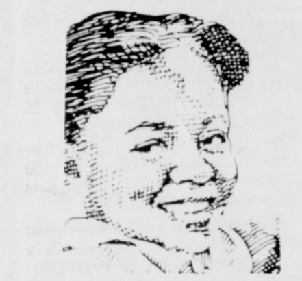
Kindness is a hard thing to give away; it usually comes back.

Choirs from the community will be featured, nightly. The public is cordially invited to attend. Come out! Get ready to receive a powerful blessing.