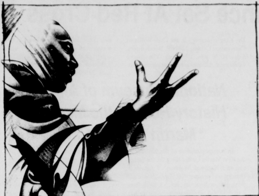
Martin Luther King 1929-1968

"I have a dream that one day the nation will rise up and live out the true meaning of its creed...all men are created equal. "