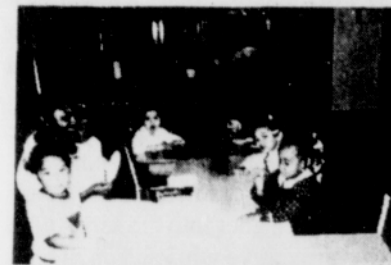
3 Years - Writing ABC's