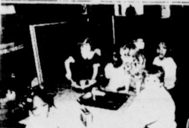
4 Year Olds - Making Cookies