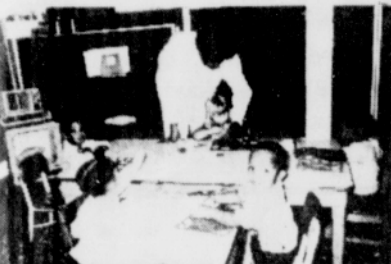
2-1/2 Year Olds - Learning Shapes