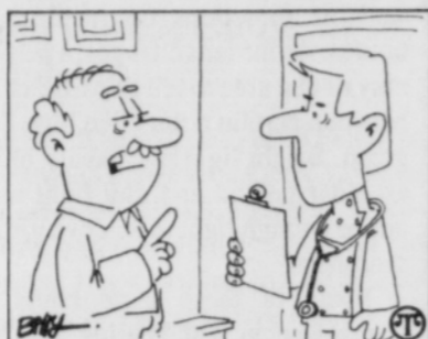
Doctors today can control severe pain without having to worry about causing drug addiction.

Many doctors are finding that the best way to administer morphine is in an immediate-release form like that provided by morphine tablets, morphine solution, or morphine concentrated solution (Roxanol™). Immediate-release morphine has an important role in helping the doctor determine the specific dosage needs of a patient. Around the clock dosing (ATC) is recommended for managing pain