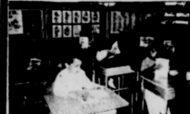
5 Year Olds - Reading First Grade Books