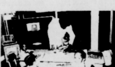
2-1/2 Year Olds - Learning Shapes