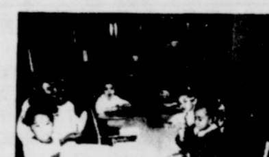
3 Years - Writing ABC's