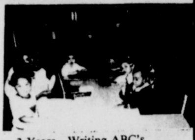
3 Years - Writing ABC's