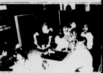
4 Year Olds - Making Cookies