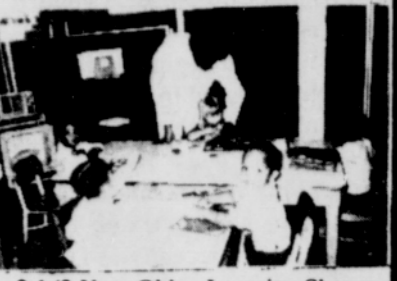
2-1/2 Year Olds - Learning Shapes