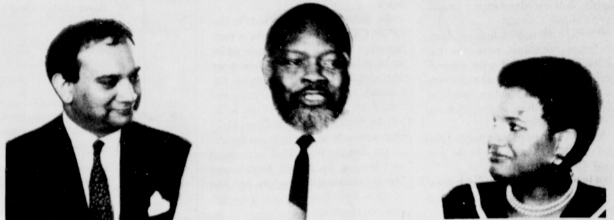
THREE OF THE FOUR MEMBERS of the recently formed Parliamentary Black Caucus are, from left, Hon. Keith Vaz, Hon. Bernie Grant and Hon. Diane Abbott. Each is a member of Parliament serving in the House of Commons. The fourth member is Lord David Pitt, a member of the House