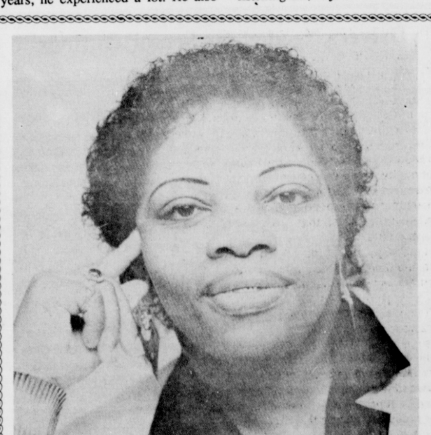
The Philadelphia Community Missionary Baptist Church 238 NE Mason Street Portland, OR 97211 PRESENTS:

Thank you for your Sweet Letter Send Some More