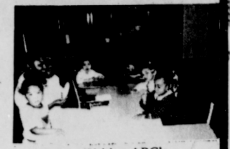
3 Years - Writing ABC's