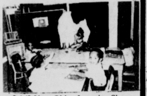
2-1/2 Year Olds - Learning Shapes