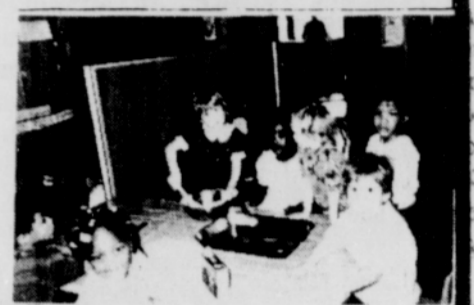
4 Year Olds - Making Cookies