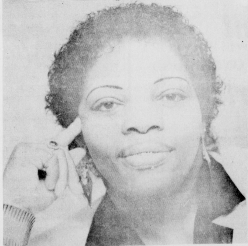
The Philadelphia Community Missionary Baptist Church 238 NE Mason Street Portland, OR 97211 PRESENTS: