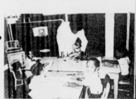
2-1/2 Year Olds - Learning Shapes