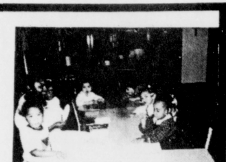
3 Years - Writing ABC's