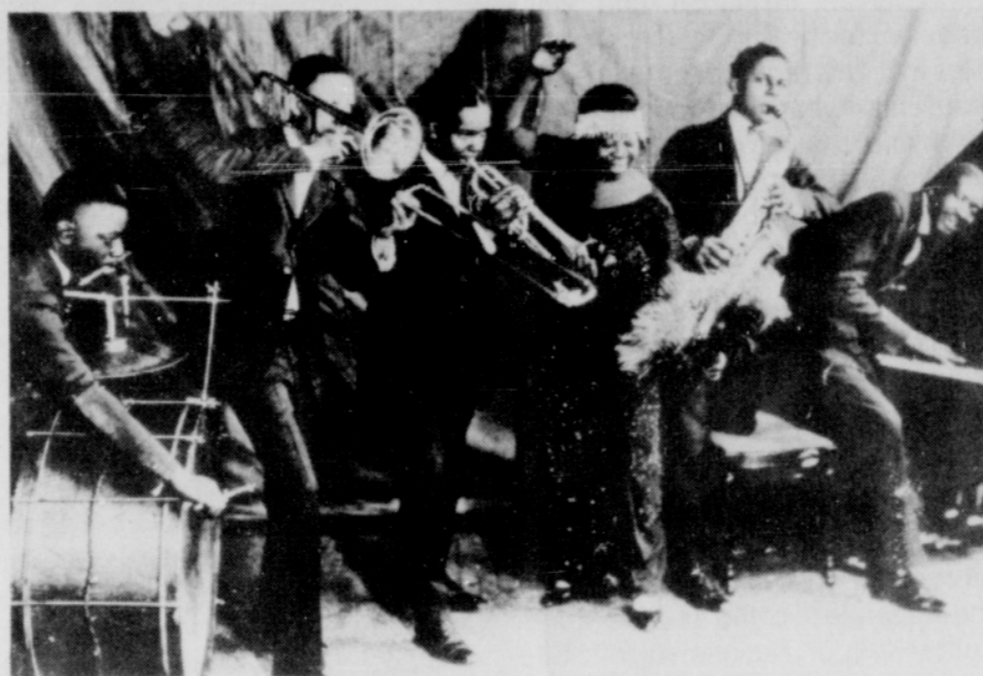
Wild Women Don't Have The Blues uses a rich blend of songs, archival photos, contemporary performances, and interviews to tell the story of America's earliest generation of great women blues singers. (above) The "Mother of the Blues" Ma Rainey with her Georgia Jazz Band. To air on OPB-TV at 10:00 p.m., ET, on February 24, 1989.