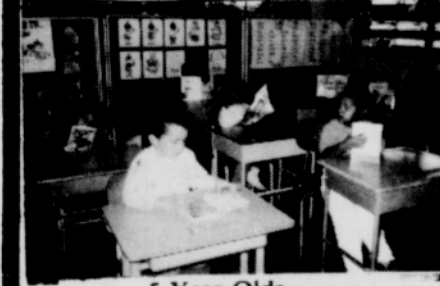
5 Year Olds - Reading First Grade Books