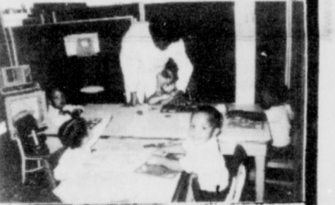
2-1/2 Year Olds - Learning Shapes