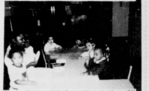
3 Years - Writing ABC's