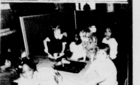
4 Year Olds - Making Cookies