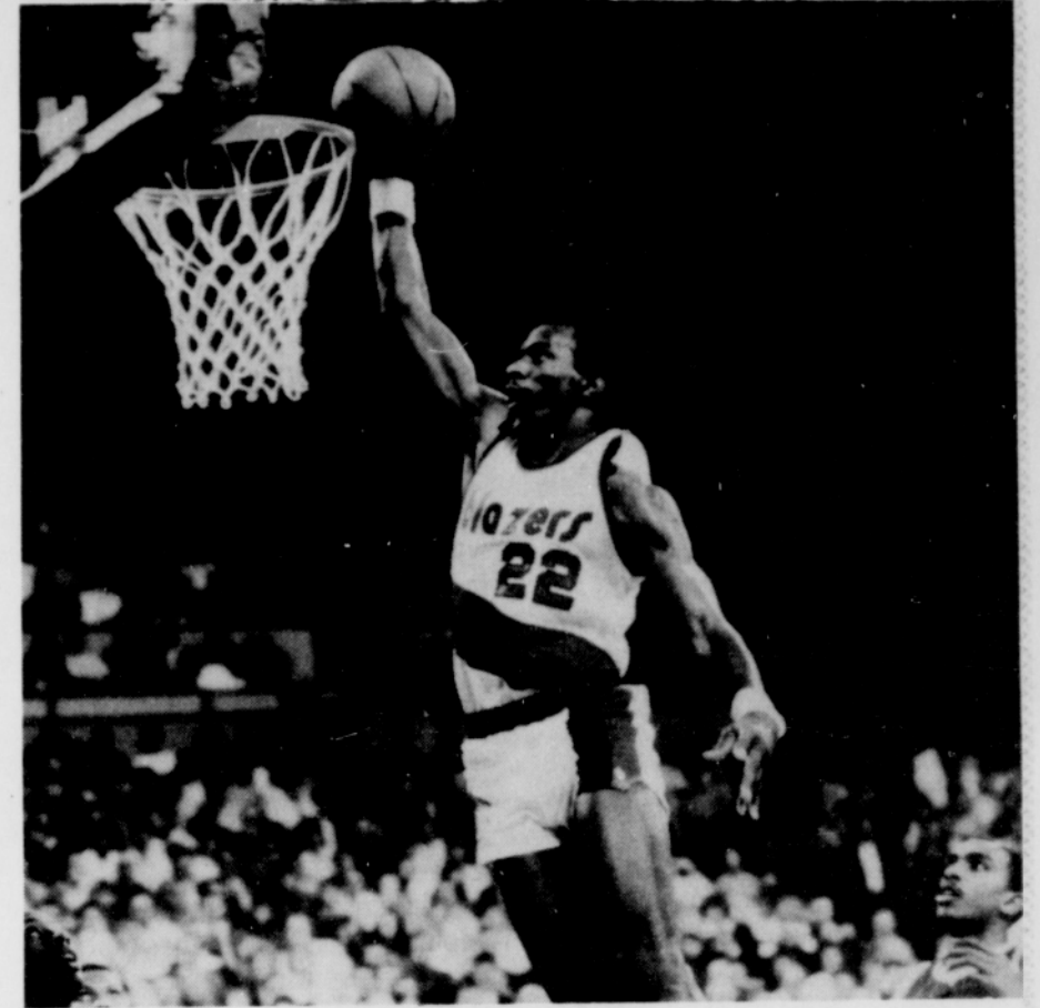
Clyde Drexler - #22 Portland Trailblazers

PORTLAND OBSERVER "The Eyes and Ears of the Community" 288-0033