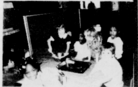
4 Year Olds - Making Cookies