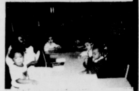
3 Years - Writing ABC's