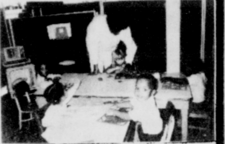
2-1/2 Year Olds - Learning Shapes