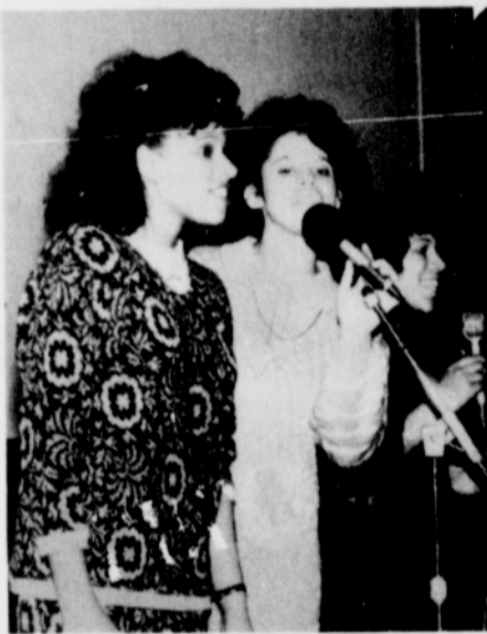
The Brown Sisters

PORTLAND OBSERVER "The Eyes and Ears of the Community" 288-0033