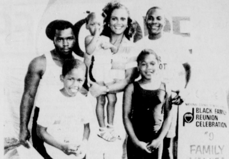
Jayne Kennedy-Overton was a popular attraction at Los Angeles' Black Family Reunion Celebration held on August 27. Jayne conducted a workshop and discussion at the Scope Family Values Pavilion on the role of parents in fostering a strong family ethic. The event, made free to the public thanks to sponsorship by Scope Mouthwash and others, attracted over 100,000 people who also enjoyed entertainment by Melba Moore and other major recording artists in addition to the exhibits and workshops. Now in its third year, the Black Family Reunion has drawn more than 1 million participants in ten previously held events across the country.